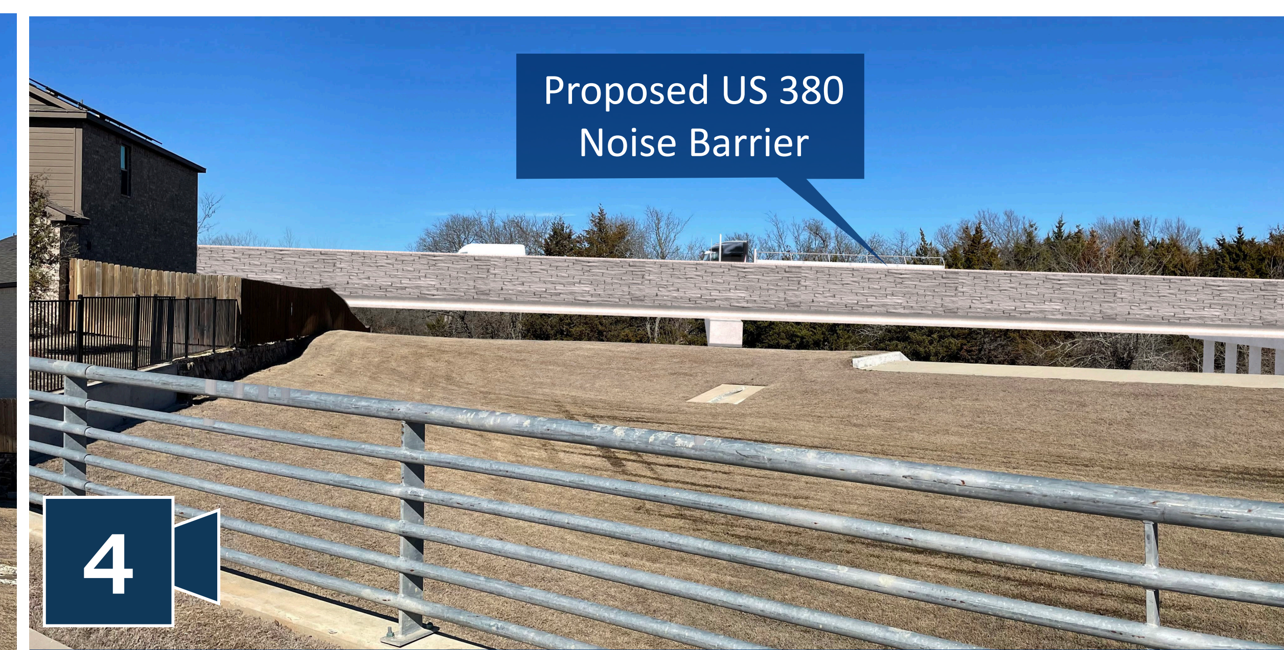
Ground View – Back of Noise Barrier

The renderings are not to-scale and shown for illustration purposes only. Actual views are subject to change.