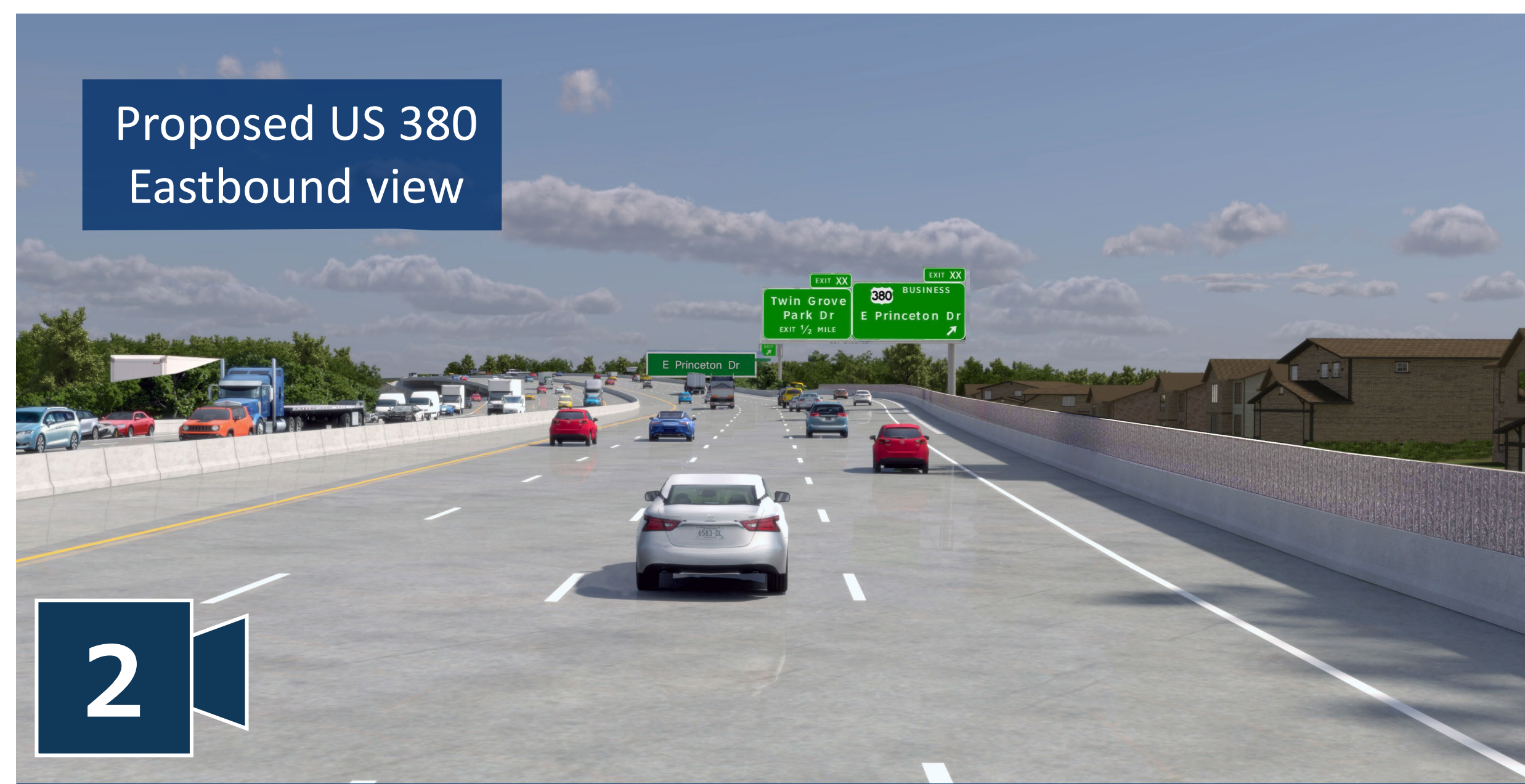
Ground View – Front of Noise Barrier