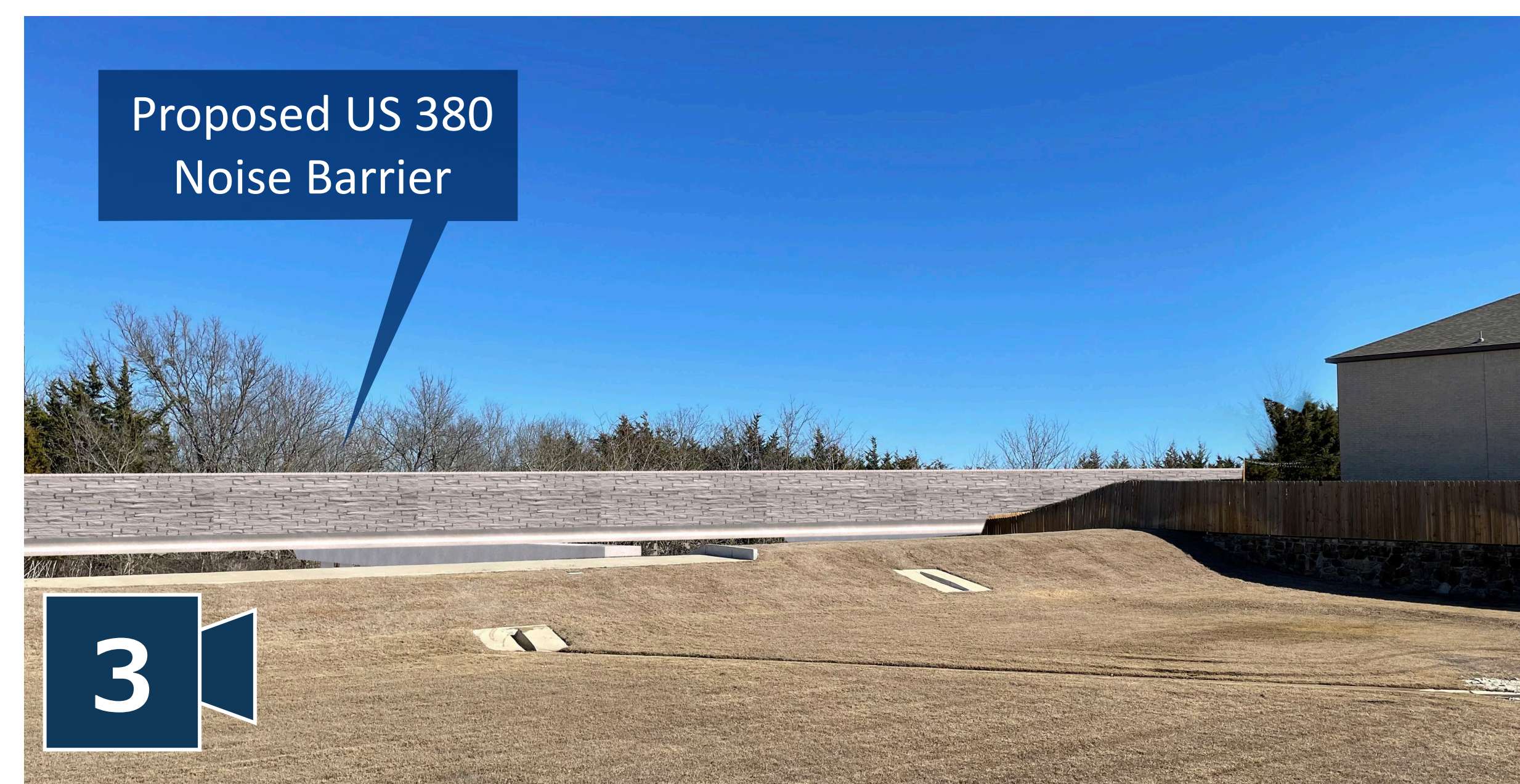
Ground View – Back of Noise Barrier